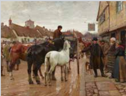
Market Day, 1907, William Frank Calderon