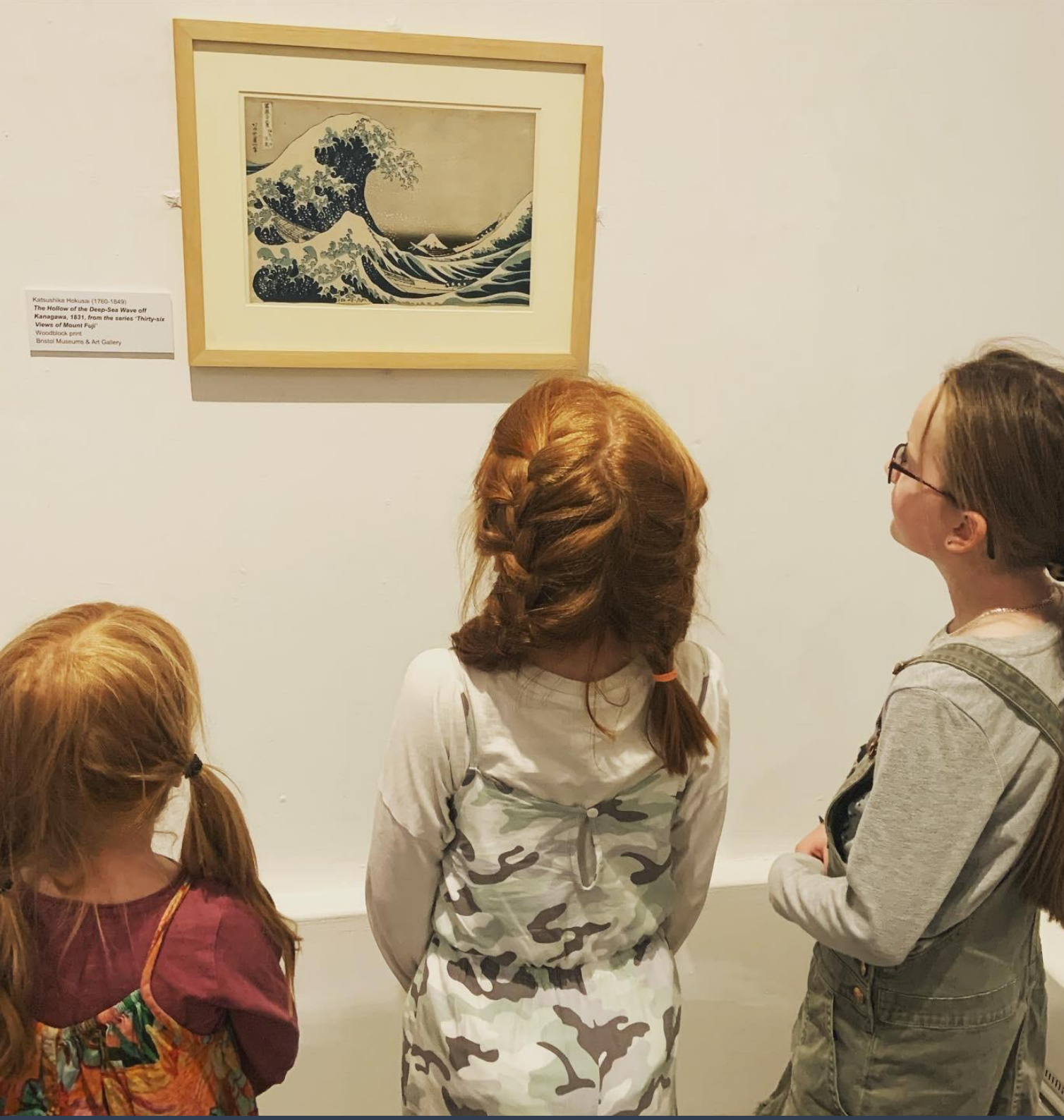
Katsushika Hokusai (1760-1849) The Hollow of the Deep-Sea Wave off Kanagawa, 1831, from the series 'Thirty-six Views of Mount Fuji' Woodblock print Bristol Museums & Art Gallery