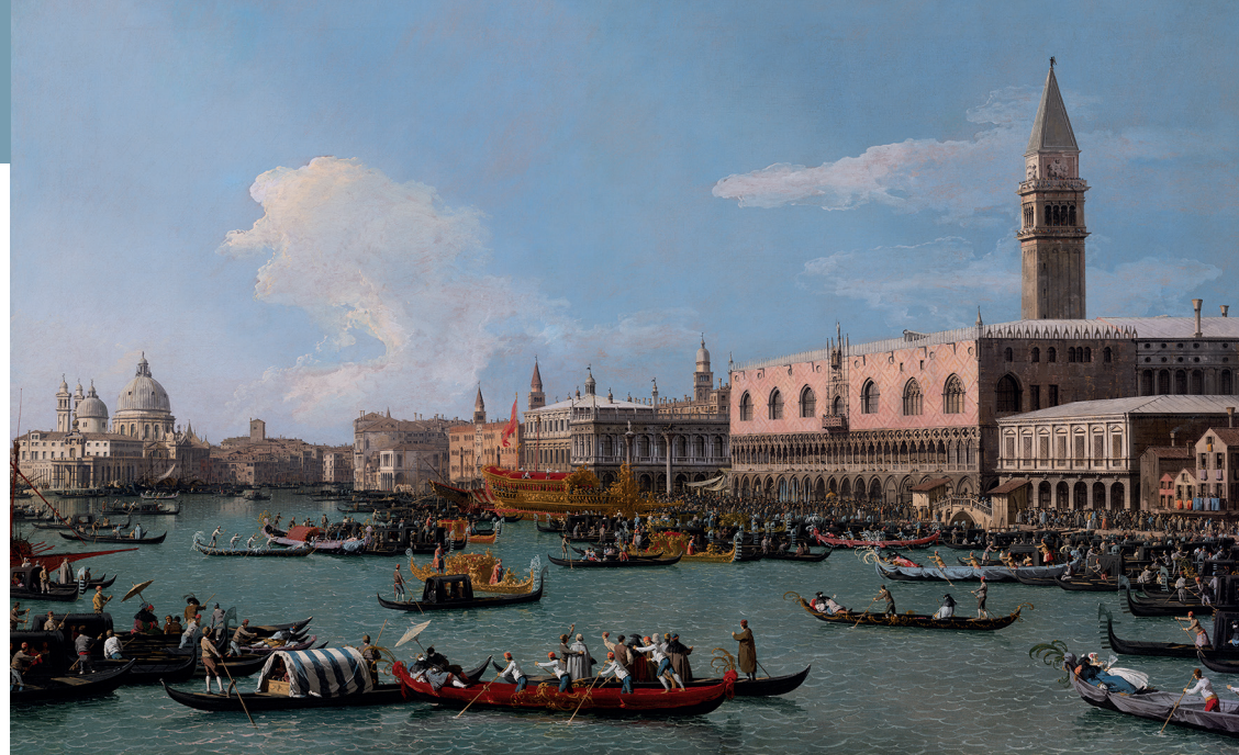
View on the Grand Canal: From the Palazzo Bembo to that of Grimani Calerghi, now Vendramini. From The Woburn Abbey Collection.