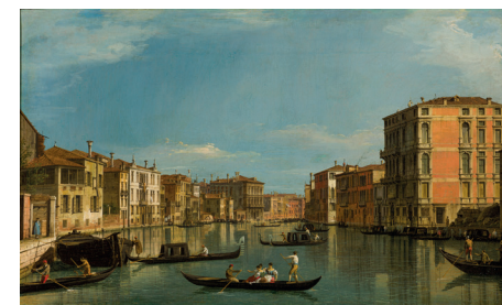
Embarkation of the Doge of Venice, for the Ceremony of the Marriage of the Adriatic. From The Woburn Abbey Collection.

With thanks to Birmingham Museums Trust and Woburn Abbey for loans from their collections, and to Worcester City Council for supporting the exhibition.