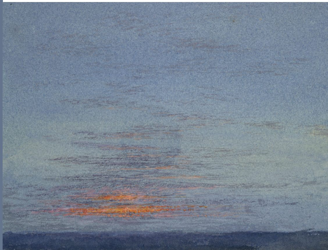
John Ruskin, Study of Dawn: The First Scarlet on the Clouds, 1868

To book see www.museumsworcestershire.org.uk